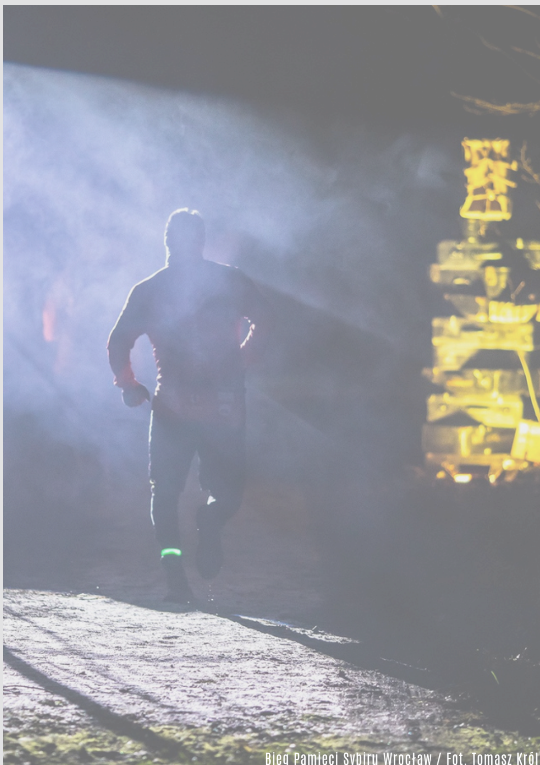
Bieg Pamięci Sybiru Wrocław